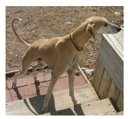
A smooth Saluki.

We carefully screen prospective adoptive homes to make sure they are appropriate for a Saluki. This includes extensive interviews and a home visit. Our adoption contract guarantees that if, for any reason, an adoptive home is not able to keep a Saluki that dog will be returned to STOLA for rehoming. Salukis always have a safe haven at STOLA.